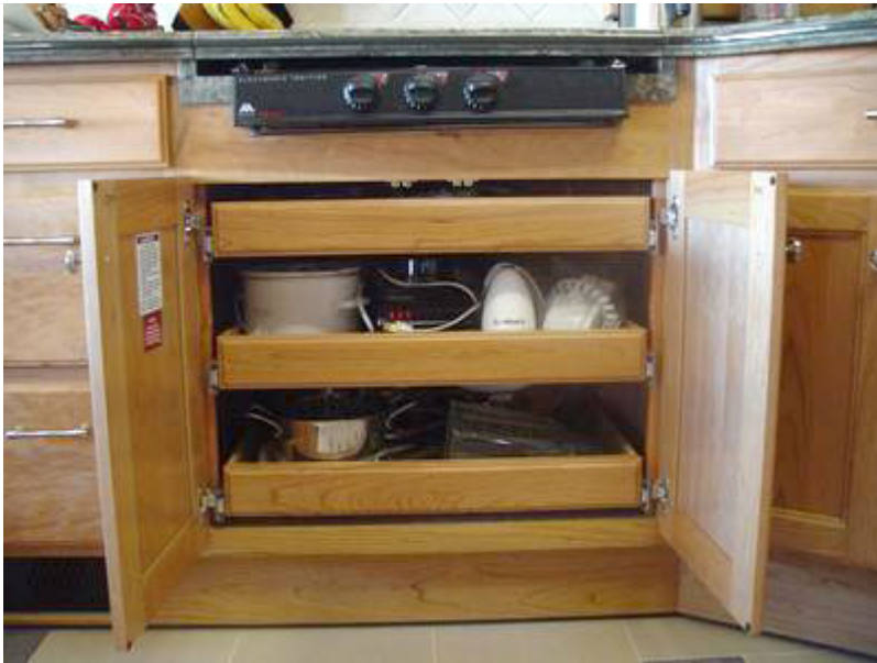
We had the shelf removed and three slideout trays added.