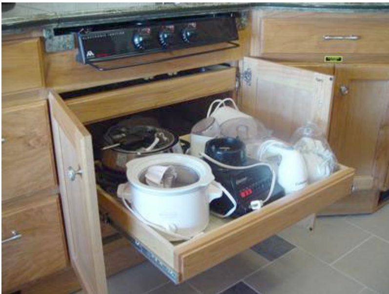
Middle tray for electrical items.