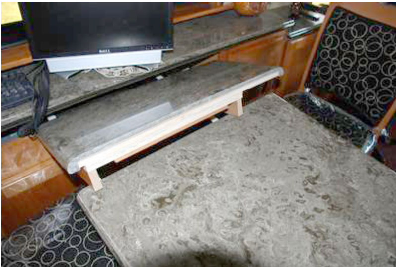
Table fully extended and leaf being inserted. Notice the offset of the table top on the leaf.