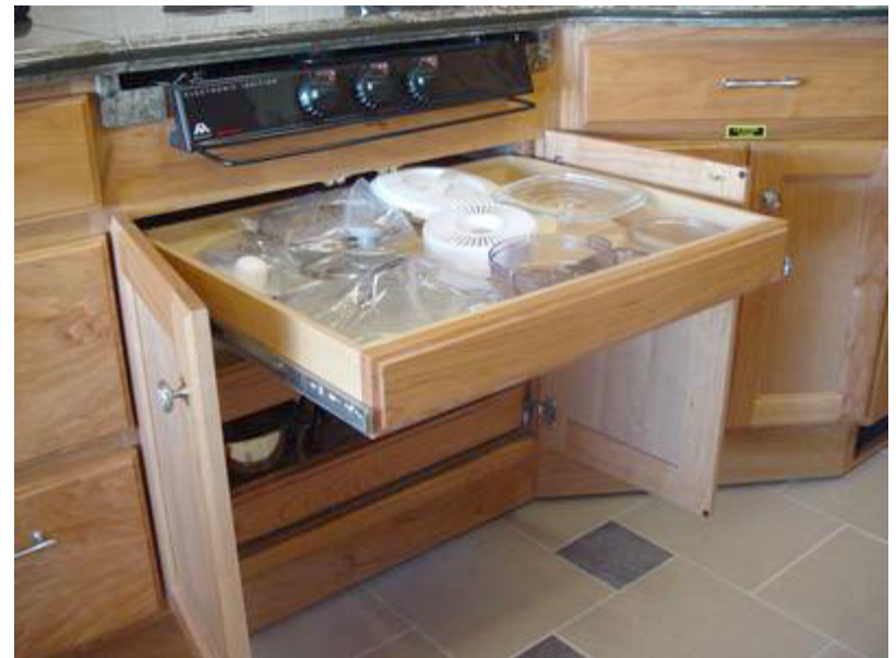
Top tray for lids.