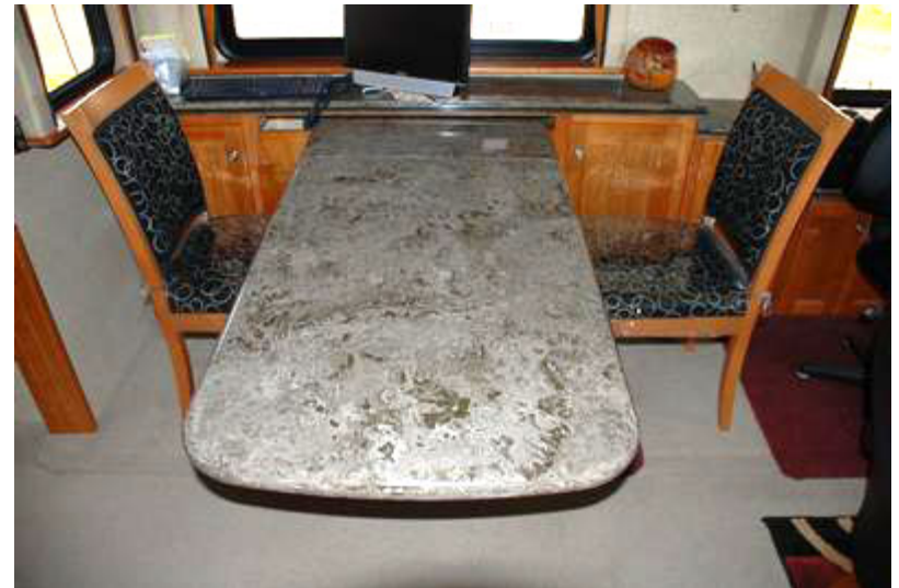
Table fully extended but without the leg attached that should be used when it is fully extended. Now company does not have to have their chairs partly on the slide and partly on the floor.