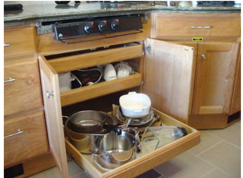
Bottom tray for large pots