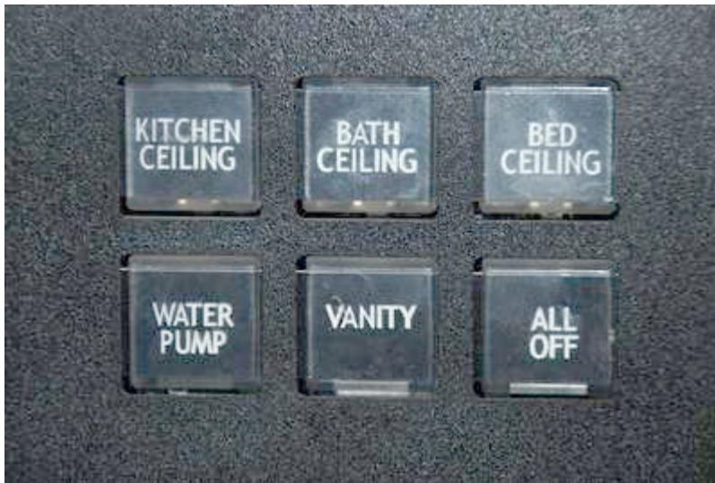
Various Intellitec switch panels were not fully programmed. This bath hall switch did not allow you to turn on the bedroom light. You had to enter half way into the bedroom to turn it on or off. Here the top three buttons are in a logical sequence for walking to the rear or front of coach and turning on/off lights. Also added the Vanity light switch. These switches can be re-programmed by the techs.