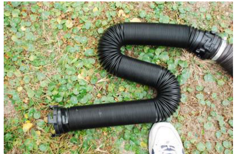
I love the ridged sewer hose which expands and flexes while retaining its memory. Available from Camping world. Get the swivel male and female connectors for the ends