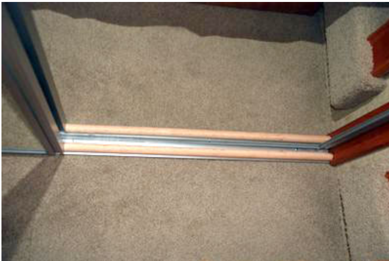
Secure the wardrobe door with wood dowling. We had one pop open and slam, destroying one mirror.