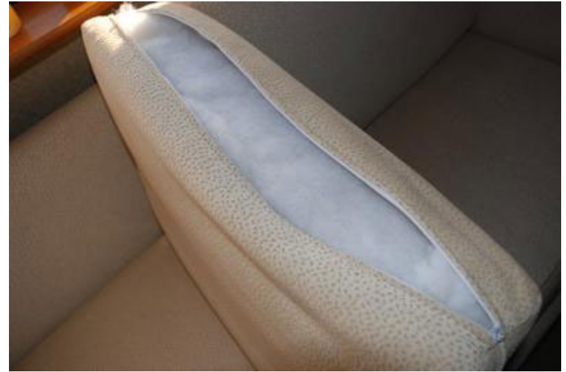
We had the batting removed and foam inserts (wrapped lightly in batting) added. Now we can sit upright.