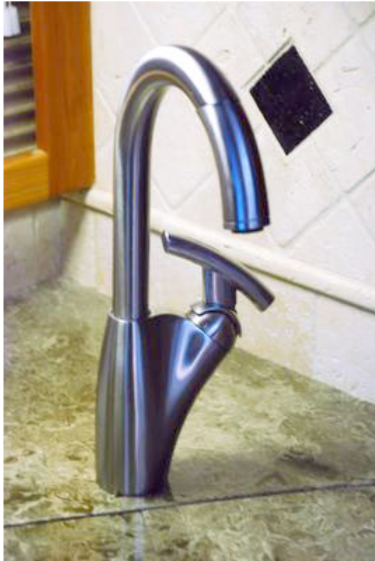
Found this beautiful Bach Solo kitchen faucet on e-bay.