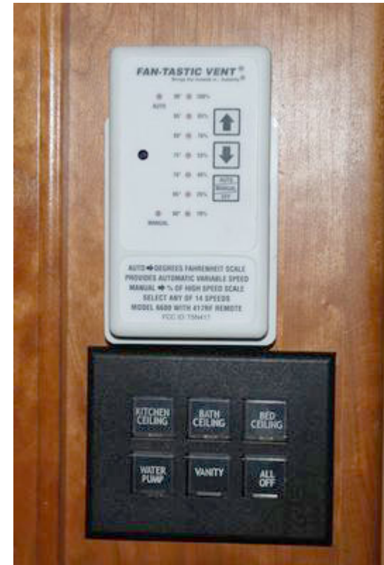
The Allure 430 2007 & 2008 come with inexpensive Fantastic fans without temp control. Fantastic makes a RF Remote control upgrade (6600R). Now we can set a temp for it to run and slows down to a stop. Great for overnight cooling, or while you are away for the day.

For more details about these changes, contact: Herb Strandberg, 916-759-8000, yahoo4herb@where-rv-now.us