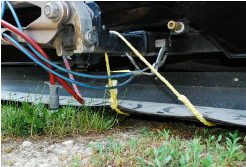
Easy way to rain the mud-flap when backing up. A short length of rope with loops to hook over a couple of existing bolts on the back side of the mud flap. No more dragging and scraping when backing into some sites, especially with the tag axle up.