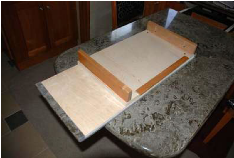
We had a leaf built for the table (underside shown here). Table now extends 21 inches from its fully closed position.