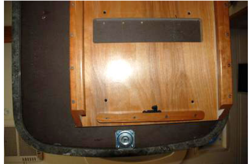
View of underside of table. By offsetting the table, removing a slide limit, gluing the top down to the slider, and adding a screw-in leg, we were able to get space to add another leaf.