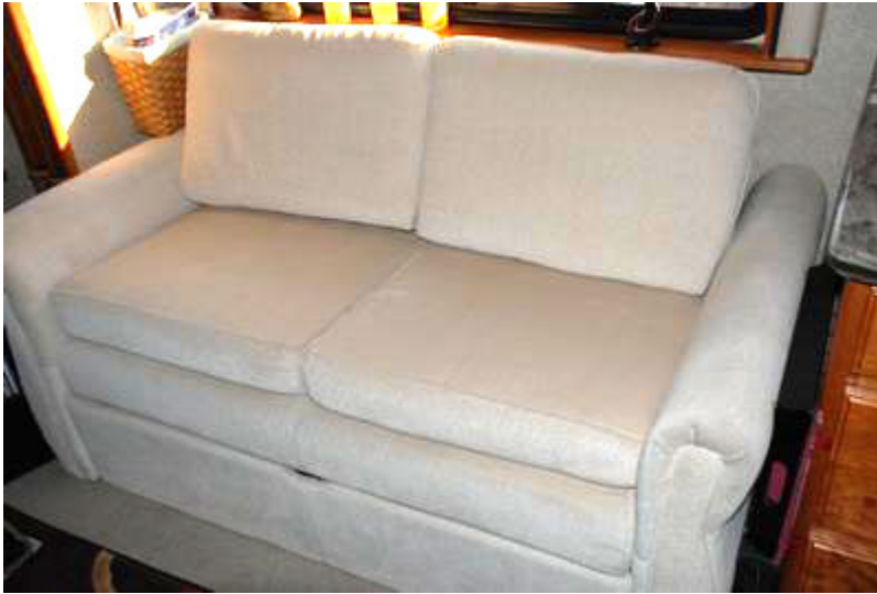
This sofa comes with terrible back cushions just stuffed with batting.