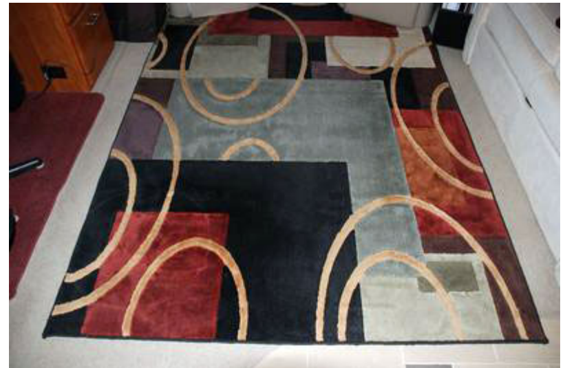
Nice 5x7 rug with, by luck the CC logo shapes. We lay it over our regular rug. When we bring the slides in, we fold the two sides inward (into thirds) and walk down the aisle on the carpet back.